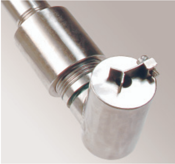
One of the industry's most unique viscometers for in tank blending and reaction monitoring.

FOR VISCOSITY MEASUREMENTS FROM 0.2 TO 20,000 CENTIPOISE